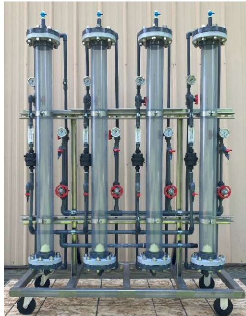
Figure 1. PFAS Pilot System

A picture of the pilot system is presented in Figure 1 below. The pilot skid measures 60” L x 28” wide x 80” high. The connection from the tank pump to the PFAS pilot system will be made using a 1” hose with cam lock fittings. This connection supplies both the raw water and the backwash water and should be capable of supplying up to 4 gpm at a minimum of 40 psi. A bag filter housing with a 10-micron filter element and pressure regulator will be included. The inlet manifold will include a chemical feed injection point (not used on this pilot), an in-line static mixer, and a piping system with valves that allows the columns to be operated/isolated as needed and backwashed when needed. Each column has a filter nozzle installed in the bottom of the column to retain the media. Each column can be individually backwashed even when the other columns are in normal operation. For each column, there are sample taps before and after each column. A mid column sample port will also be installed in the columns to allow for a sample to be taken at the 50% level of the media. The effluent from the columns is piped into a manifold with a 1” camlock fitting.