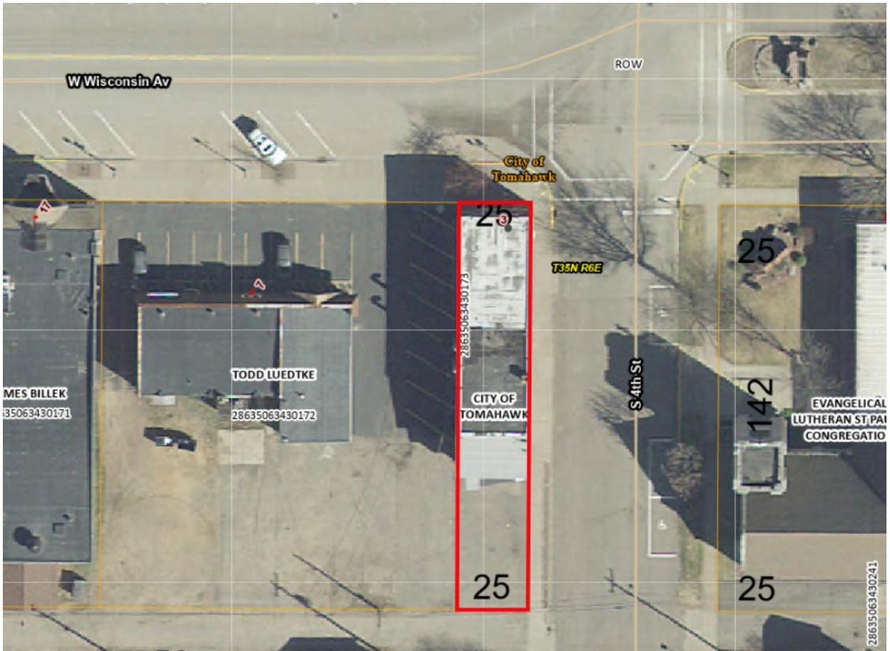
EXHIBIT B – MAP