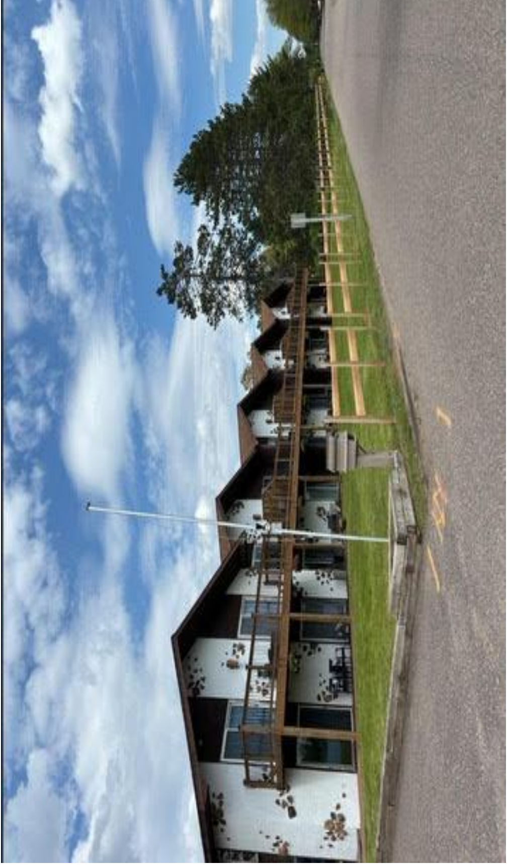
Proposed View (New Oak Fence running the length of property)